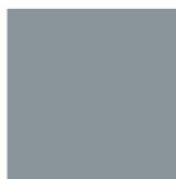
CELESTE RAL 7001