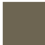
TORTORA RAL 7006