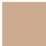
ROSA CIPRIA SIKKENS EO.11.67