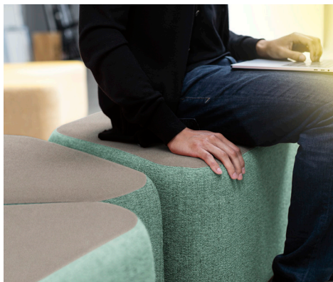
One seat. Two looks.