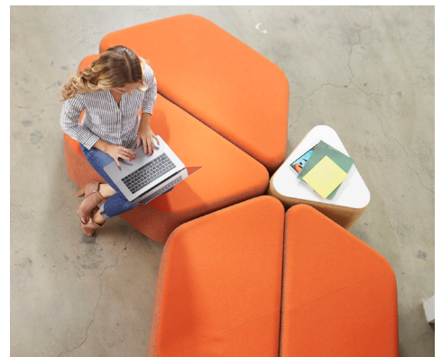
Simple and smart