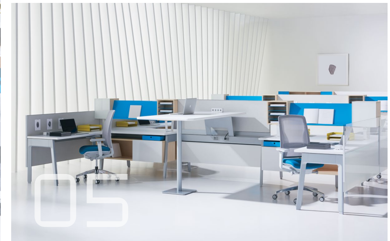
01 suspended credenza