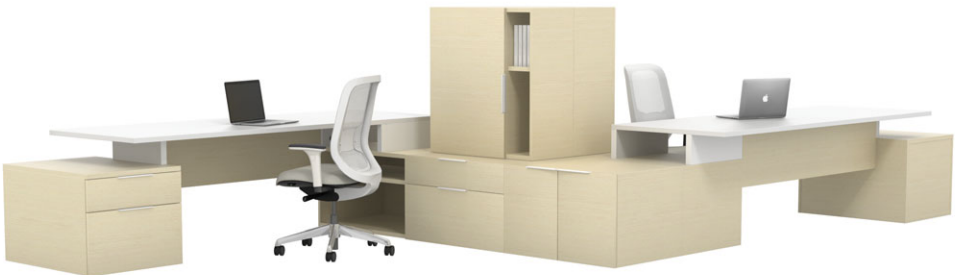
open plan Double office, extended pedestal; raised worksurface with standoff.