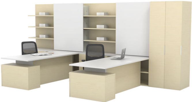
double office Working wall; sliding doors, floating shelves; wardrobe storage.