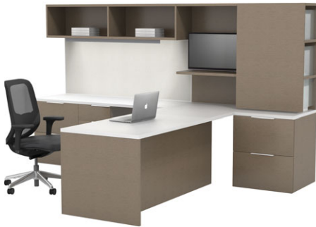
open plan Transitional area; seating; open/closed storage.