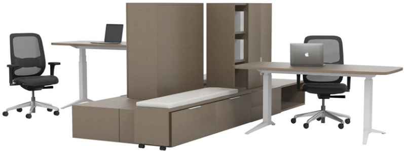
open plan Double office; height-adjustable tables; pivot bench; stacking storage.