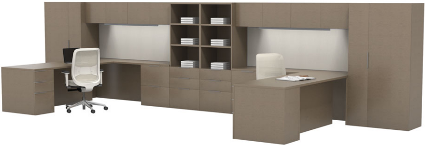
double office Working wall; wardrobe/open storage; tackboard.