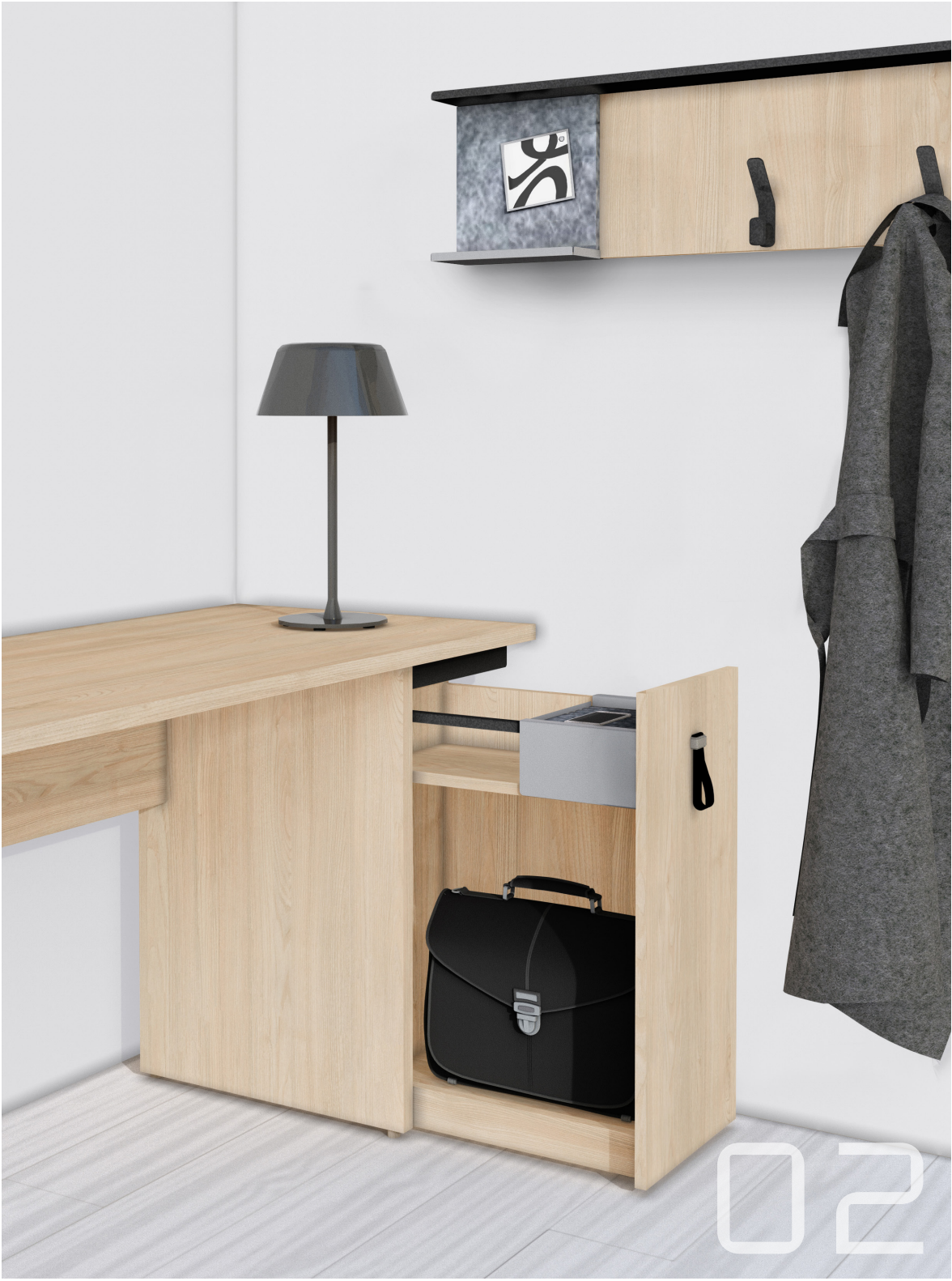
02 desk with pedestal Desk options include an integrated pedestal to store personal items. The pedestal also features a sliding accent tray with felt liner to store small items. 01-02 wall shelf Wall Shelves add both functionality and personality to a space. A 4-inch deep metal shelf displays artwork and holds dividers to organize workflow. Shelves with coat hooks and a tackable felt board are also available.