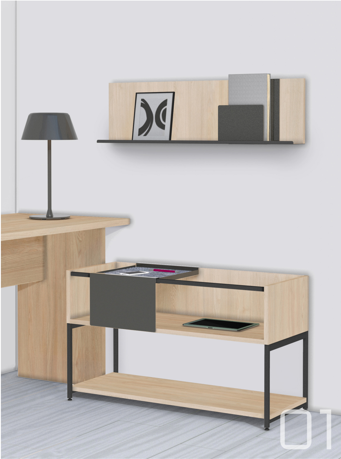
features 01 low cabinet, top access The Low Cabinet, Top Access features an open cabinet case with accent tray that glides along the crossbar. Grooves in the felt liner accept personal items and work tools.